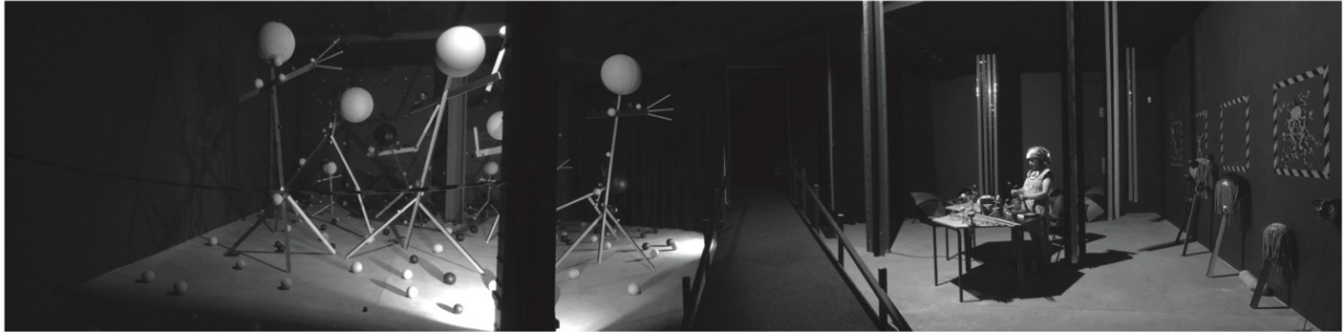
SCHOOL OF CHANGE 2012 video installation