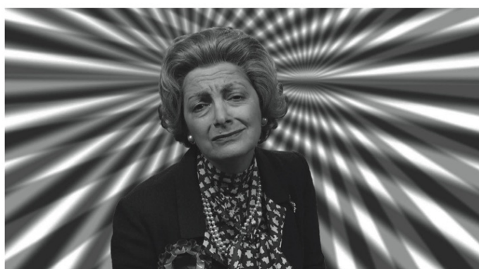
All Suffering SOON TO END 2010 video installation