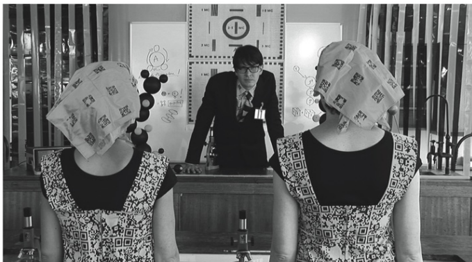
All Suffering SOON TO END 2010 video installation